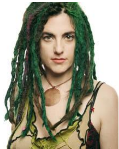
Bitch's debut LP entitled "Make This/Break This" is due out late fall of 2006. She lands March 2 to perform in Cambridge at Club Passim and the following day at Café Nine in New Haven.

She hasn't dropped Bitch just yet though. For now, just keep calling her Bitch. And she's happy to be solo even though it's super overwhelming and the impulse to hustle